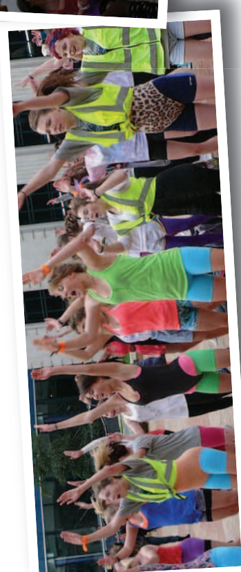
Civic Square Zumbathon for World Vision